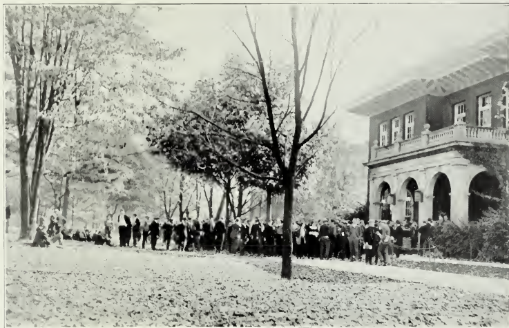
GOING TO DAILY CHAPEL EXERCISES